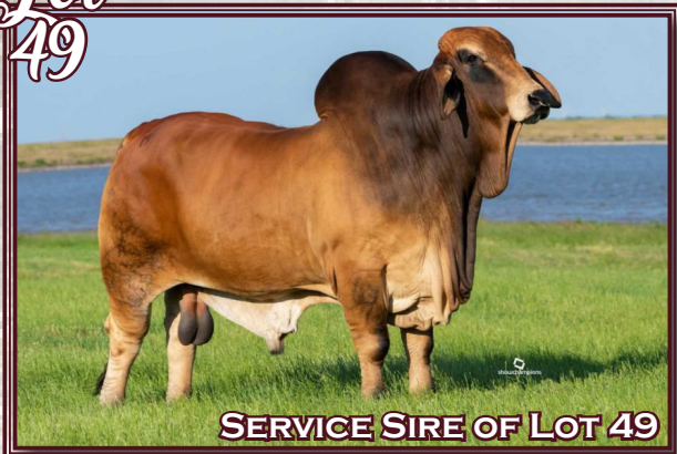
SERVICE SIRE OF LOT 49