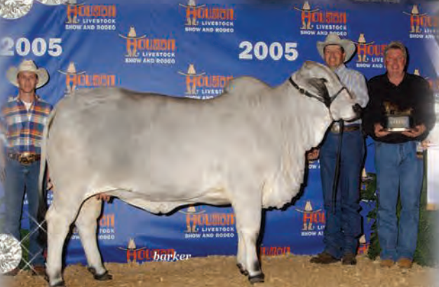
Ms. Tiara Diamond D'Oro 273 2005 ABBA Show Cow of the Year