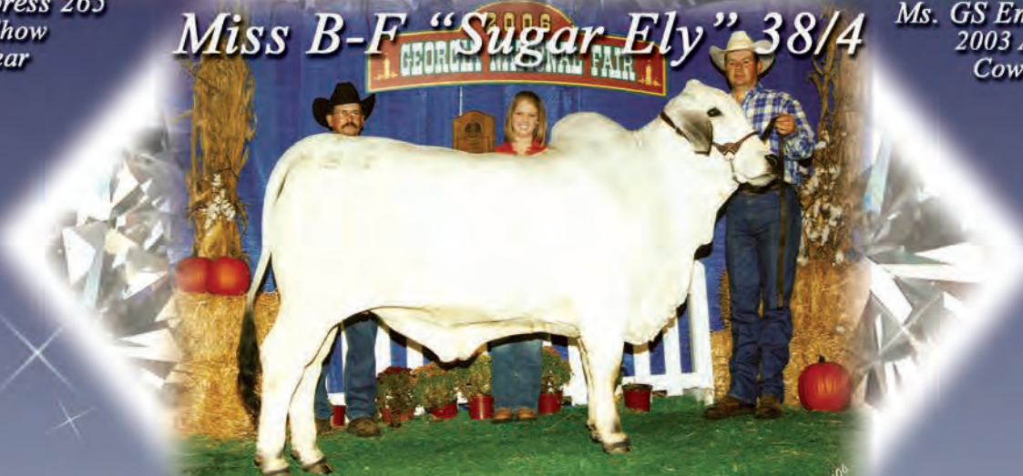
2007 ABBA Show Cow of the Year