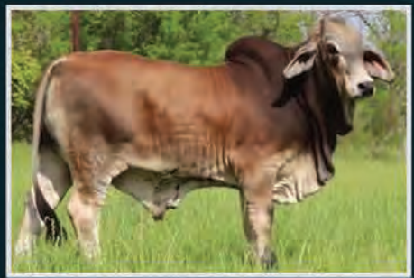
MR. V8 739/7 "Chivalry"

Offering Show Prospects, Donors, Embryos, Flushes with sires such as (+)JDH Karu Manso 800, + #JADL Rey TE 110, Mr. V8 139/7(P), Mr. V8 733/7(P), JDH Mr Sanderson Manso 923/1 and JDH Mr Ducote Manso 509/8