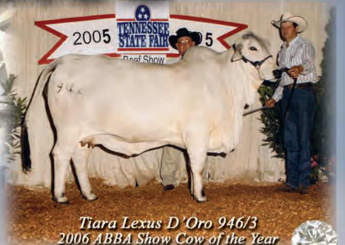
Tiara Lexus D'Oro 946/3 2006 ABBA Show Cow of the Year

We invite you to be a part of the 135 dynasty!