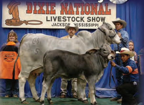
Ms. GS Empress 265 2003 ABBA Show Cow of the Year