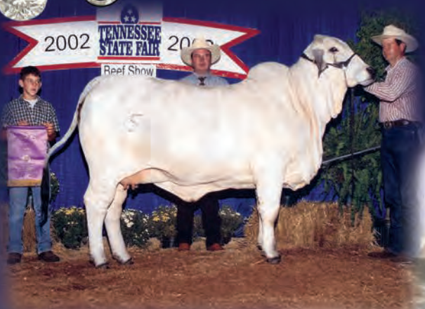
Ms. GS Empress 265 2002 ABBA Show Cow of the Year