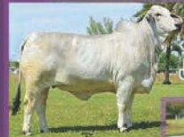
MISS L2 JAZZY 21