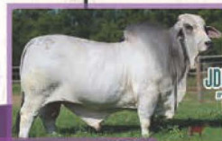
JDH MR MANSO 840 "THE GRADUATE"