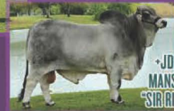
JDH MR MANSO 638 "SIR RICHARD"

Daughters of JDH Mr Manso 840 "The Graduate", +MISS L2 JAZZY 21, +JDH MR MANSO 638 "Sir Richard", +#JADL REY 110, +JDH MR. UNION MANSO 455/3 and JDH SIR CLIVE MANSO 861/8 will be offered in this Elite Sale!