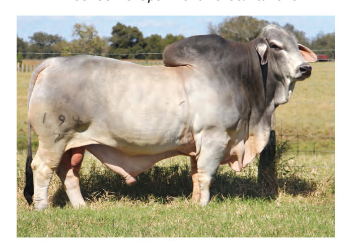
Sire Mr. V8 194/7

ABBA # 1032954 | Open Heifer | 03/15/2020