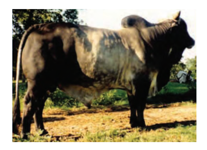
Sire DCH Aggie Grande 625