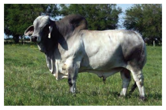
Sire JDH Sir Gates de Manso 480/7

ABBA # 968373 | Pair Heifer / Bred / Donor | 09/05/2015