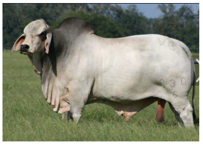
Sire Mr. V8 830/6

ABBA # 1032958 | Open Heifer | 03/27/2020