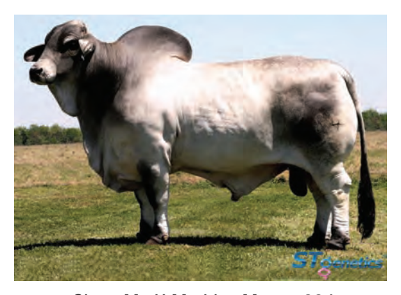
Sire +Mr. H Maddox Manso 684

669048 (+) JDH MADISON DE MANSO [737/4] 717162 + JDH MR. MANSO 360/1 [360/1] 646052 = JDH LADY MANSO 30/9 F [30/9] SIRE: 837246 + MR H MADDOX MANSO 684 [684] 683995 JDH DOMINO MANSO 42 [42/4] 797647 + LADY HERITAGE MANSO 173 [173] 730954 JDH LADY MEG MANSO [176]