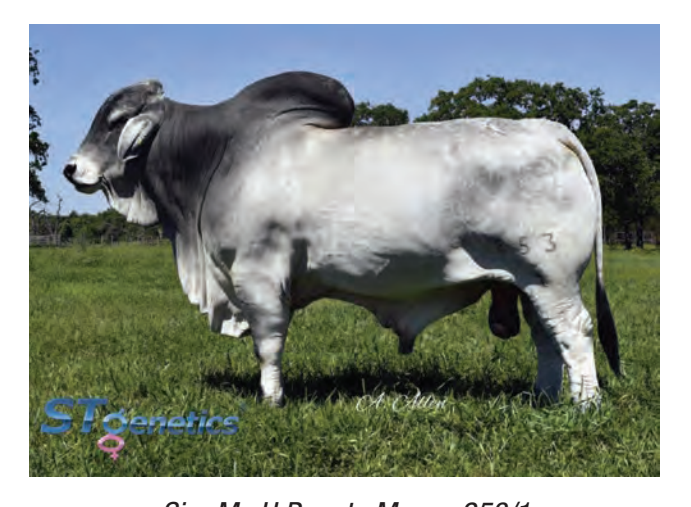
Sire Mr. H Bogota Manso 253/1